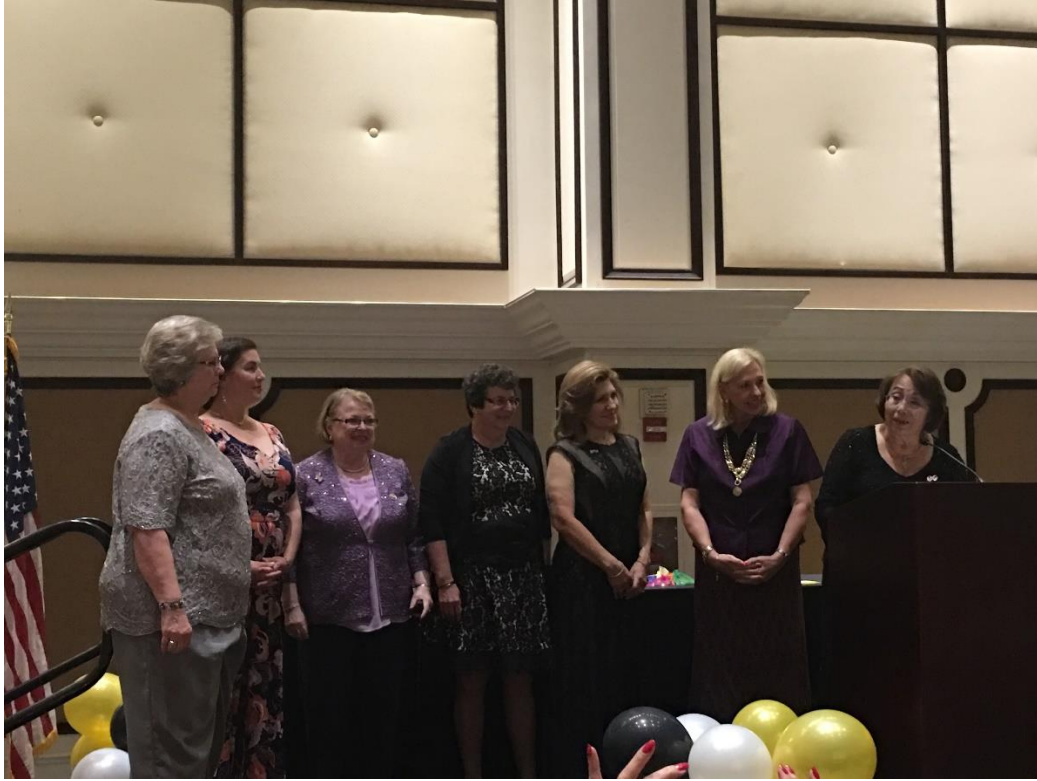
Installation of the Executive Committee (2018-2020)