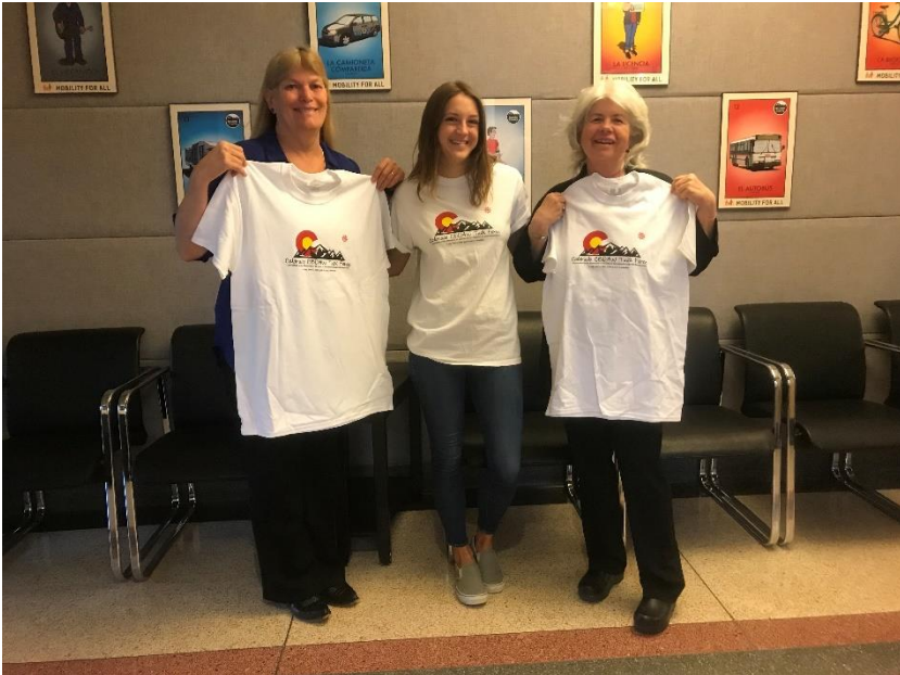
BOULDER COUNTY COLORADO ACCEPTING CEDAW T-SHIRTS AFTER SIGNING THE RESOLUTION FOR CEDAW

To see how we are doing nationally on Cities for CEDAW, please go to the campaign page of www.citiesforcedaw.org . So many cities are working diligently on this treaty! Let's all do this while we are also working on the ERA-getting that one last state, then off to D.C. for ratification. See me or send me an email at ssimmons@bpwcolorado.org for assistance. We are working on a toolkit/ambassador guide to assist in your city's work. This will be out soon! I hope to have it on the website when it is available.