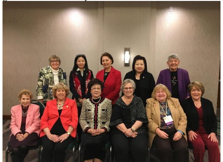
CALIFORNIA MEMBERS HAVING BREAKFAST WITH MADAM ANNETTE LU FROM TAIWAN