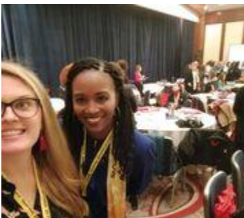
ABOVE: YOUNG BPW NORTH AMERICAN AND CARIBBEAN DELEGATES

BPW International has taken on the United Nation's 17 Sustainable Development Goals (plus one more - how to keep BPW sustainable for generations to come) as a guideline to get its members creating a better tomorrow. Click here to learn more about the story behind the SDG's. Basically, the SDG's break down the issues of the world into digestible action plans, everything from No Poverty to Reduced Inequalities to Climate Action, and offers guidance for how the individual can help. Because, say it with me now, it takes each one of us choosing to take action in order to influence a cultural shift.