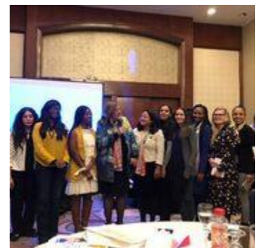
ABOVE: YOUNG BPW ALL REPRESENTED AT CSW

So, what does this look like? Well, for the Young BPW members at this year's Leader's Summit, we came up with an action plan to keep BPW thriving. Then, each one of us talked about how we would bring the SDG's into our community. Young BPW members talked about offering seminars in women's heart health, educating their community on unpaid care work and its effect on women's retirement; and, for me, offering my documentary film " Pioneers in Skirts " as a tool to help get more women to the decision making table.