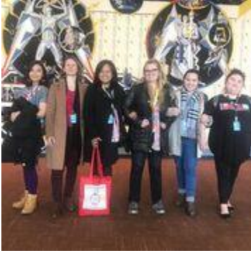
ABOVE: YOUNG BPW AT THE UN

And all of this was before the Commission on the Status of Women even began at the United Nations! The week progressed with intense international talks of what women are dealing with on a global level. BPW members joined in on the conversation by holding their own packed panels, too. Delegates came to the UN wanting solutions they can bring back to their own countries. I even witnessed Ireland's realization that Uganda had a much better tactic for bringing more women into a company - they only receive government funding if the company is gender equal. Ireland may implement this in their own funding process now!