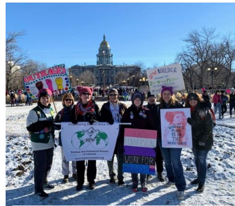
COLORADO WOMEN'S MARCH JANUARY 2019