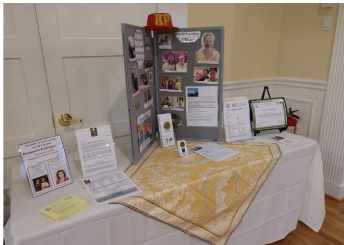
THE PHOTO IS OF THE DISPLAY THAT WE HAD FOR NATIONAL AT CONVENTION