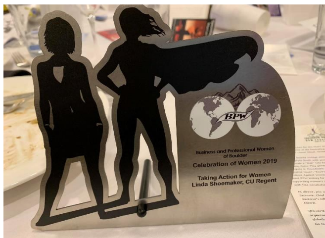
AWARD FROM BPW BOULDER CELEBRATION OF WOMEN EVENT