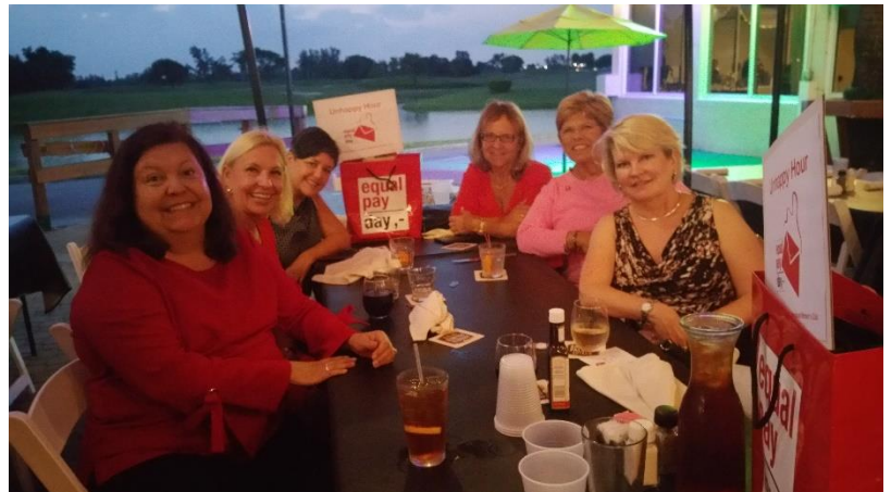
APRIL 2ND EPD "UNHAPPY HOUR"