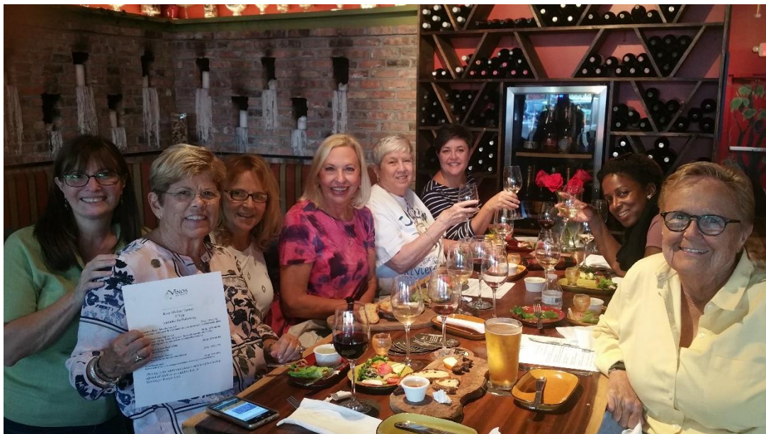
SO. FLORIDA APRIL SOCIAL "WINE TASTING EVENING"